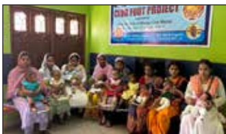
Club Foot Follow up Clinic