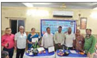
NBA and Teachers Day Celebration