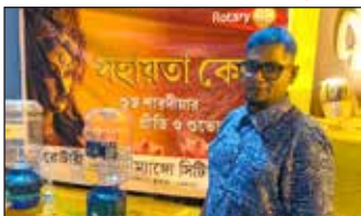
Water and First-aid Kiosk during Durga Puja