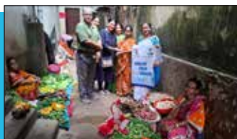
Rakhi Bandhan Celebration