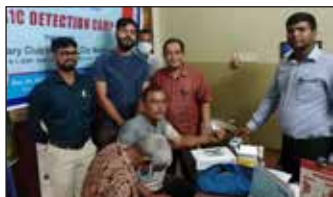
HbA1C Detecting camp on 18 September