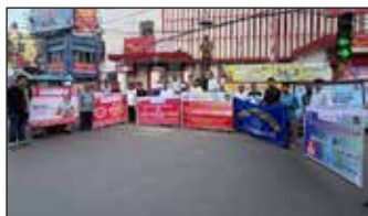
Organised and Participated in End Polio Rally on 24th October