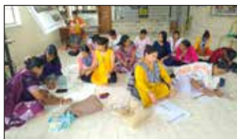
Vocational Sewing Training School, Every Friday